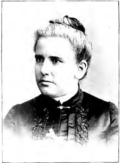
ANNA H. SHAW.

philanthropic woman offered to pay her the price of a sermon every Sunday during the remainder of her second year, if she would refrain from preaching and take the day for rest. That help was accepted. Afterwards, when Miss Shaw was earning a salary, she wished to return the money, but was bidden to pass it on to aid in the education of some other struggling girl, which she did. She often says now that, when she was preaching those Sundays while in college, she never knew whether she was going to be paid with a bouquet or a greenback. During the last year of her theological course she was pastor of the Methodist Episcopal Church of Hingham, Mass. Her second pastorate was in East Dennis, on Cape Cod, where she remained seven years. A pastorless Congregational Church in Dennis asked her to supply their pulpit until they secured a minister, and they were so well satisfied with her labors that they made no further effort to obtain a pastor. For six years she